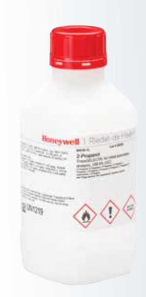
Honeywell Riedel de Haën -2-Propanol TraceSELECT 04516-1L

The elemental response is usually independent of species, so it is often possible to quantify a species even when its structure is unknown (assuming good HPLC recovery). Identification, however, is based solely on retention time matching. Therefore, a compound in the sample can be identified only by comparison with a standard.