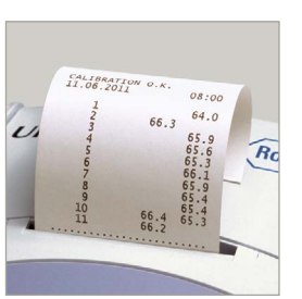
After 70 seconds, get printed results to evaluate—and put in patient's file.

Press the start button—the analyzer does the rest.