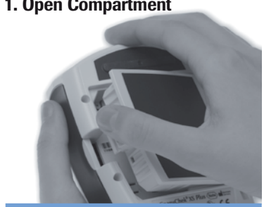
Press the release tab on the battery cover on the back of the meter. Slide the battery cover off.