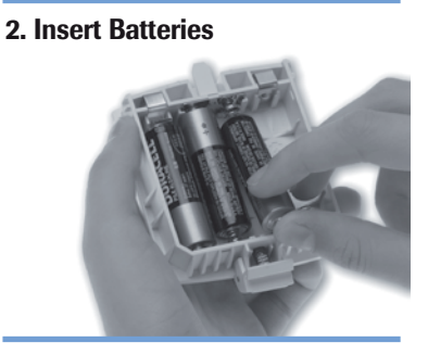
Insert 4 AA batteries according to the diagram inside the battery cover. Replace the cover.

After you insert the batteries, the meter powers on and the display changes to the