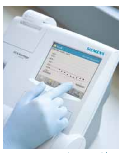
DCA Vantage™ Analzyer provides a printed trend graph that monitors your HbA1c levels over time.