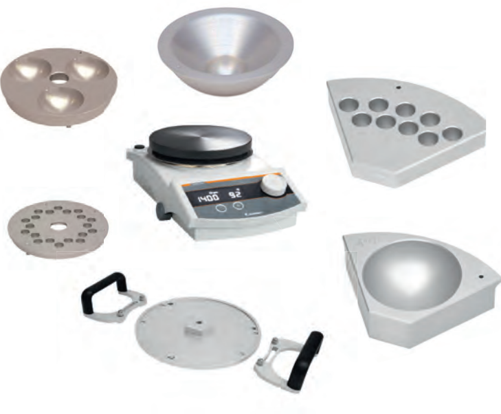
Maximize your Heidolph hotplate surface with block accessories