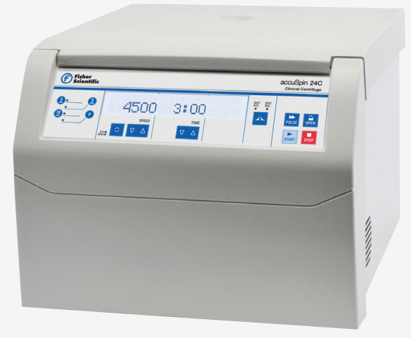
Figure 1. Fisher Scientific accuSpin 24C Centrifuge.

by Public Health England, Porton Down, UK. It also provides Auto-Lock™ rotor exchange which allows rotors to be installed and removed from the chamber of the centrifuge with the push of a button – no tools required. Finally, this centrifuge is equipped with three fixed programs standardizing the procedures being discussed in this applications note<sup>5</sup>.